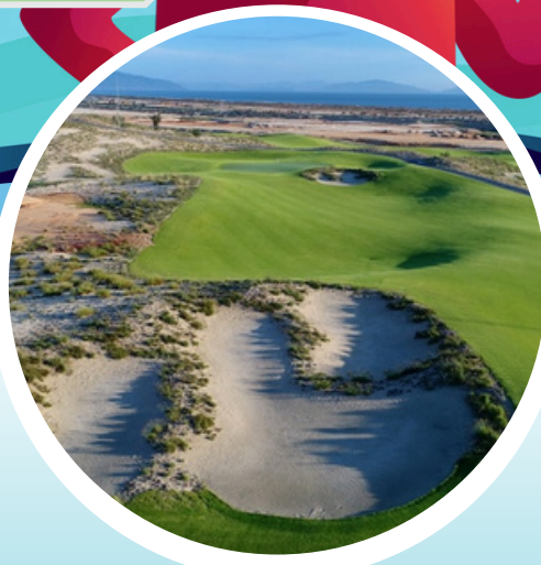
KN Golf Club