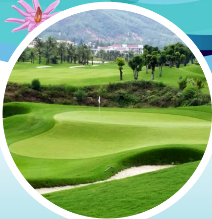
Diamond Bay Golf Club