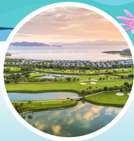
Vinpearl Golf Club