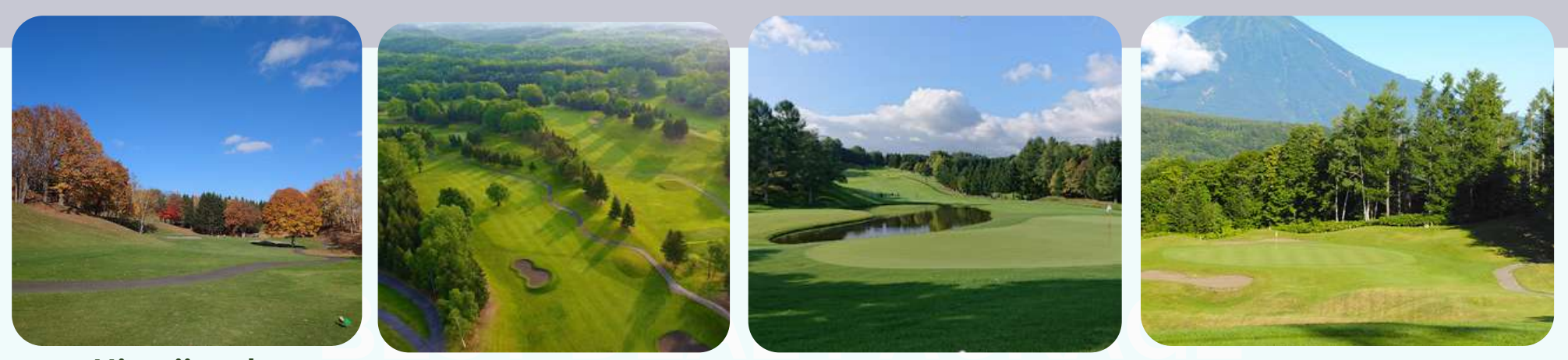
Hitsujigaoka Country Club